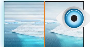
Flicker-free + Blue light

VA panel technology offers higher contrast, darker blacks and much better viewing angles than standard TN technology. The screen will look good no matter what angle you look at it.